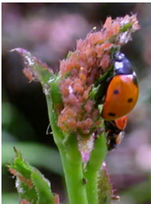
Ladybugs feasting on an army of aphids

One of the ladybugs we seem to see most often in Georgia gardens is the "multicolored Asian lady