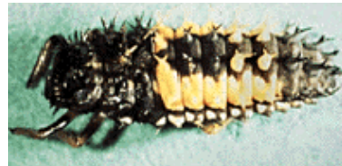
Ladybug larvae, miniature alligators of the garden

Eggs are bright yellow, and are laid in clusters of about 20 on the undersides of leaves, near a good food source like an aphid colony. The larvae have been compared to miniature alligators, elongated and spiny, dark with yellow-orange spots on the