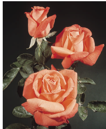
Tropicana